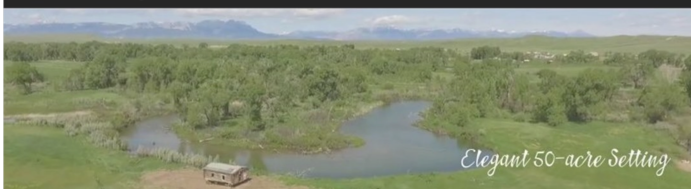
Elegant 50-acre Setting

Do you have a story you would like to tell? Call, write, email or connect via our web site and we'll help you get the word out!